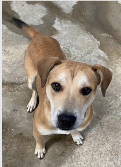
Introducing "Isla" Staffy x, female. Active, trouble-maker, but also affectionate and fun. Needs active home with routine. Loves food, easy to train.