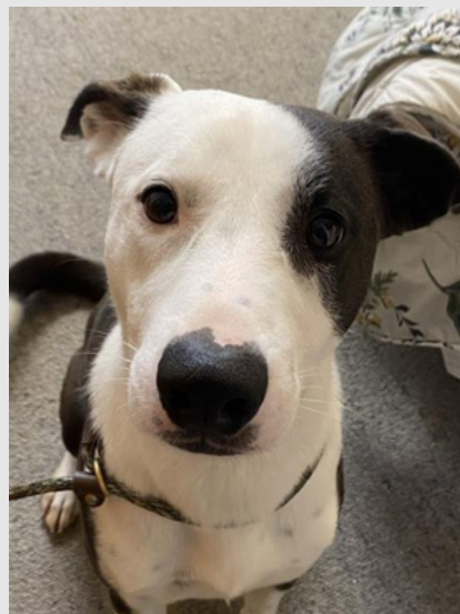
Introducing "Moss": Heading Dog x, young male. Smart, biddable, sensitive. Needs daily exercise, training and fun.

For more information, or if you can offer any of these beautiful dogs a forever home, please contact: