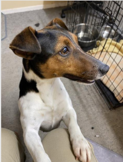
Introducing 'Minti': Jack Russell x, young female. Smart, cute, busy and a little bit naughty. Needs a fun and active home.

Help! Please ... can you give a dog a home? All here are in urgent need of a home.